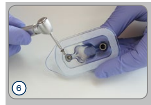
6 Remove cover screw via screwdriver