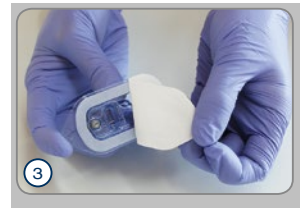
3 Remove Tyvek foil from the inner blister