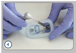
4 Insert screwdriver directly into the implant and remove