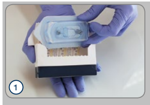
1 Open secondary packaging via tear tab and remove sterile blister