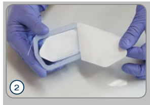
2 Remove Tyvek foil from the outer blister and take out inner blister